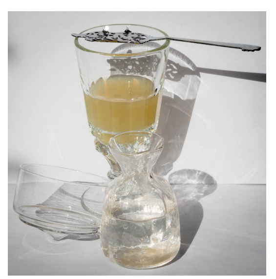
Proper glassware, including a dripper glass and Pontarlier glass, and a "La Feuille" style absinthe spoon.

The proper preparation of absinthe is very important and ought not to be ignored.