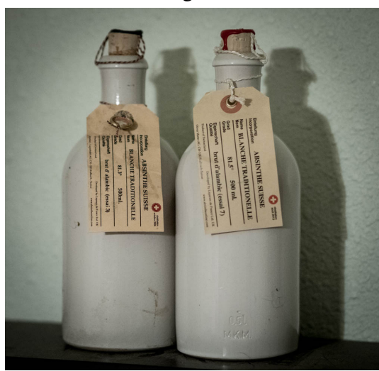
Brut d'Alembic Assays (cask-strength tests) used for perfecting a recipe; the final recipe will go into mass production, but these assays are sold in limited quantities.

After the 21st amendment was passed, homebrewing was still illegal. It wouldn't be until 1978 when a dedicated core group of folks brewing at home finally got homebrewing legalized on a federal level, though some states kept laws on their books about brewing one's own beer.