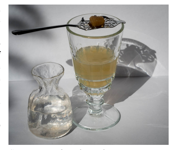
Sweetening absinthe with sugar.

I wound up finding my way to another site, one more focused on the